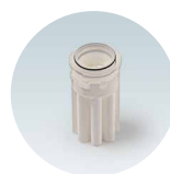
Sinter filter for membrane drying unit