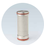
Virus bacteria filter