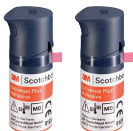
Scotchbond Universal Plus Adhesive MMO41294 Vial 5ml

BUY 2 x Scotchbond Universal Plus Adhesive Vials GET 1 x Scotchbond Universal Plus Adhesive Vial MMO41294 FREE