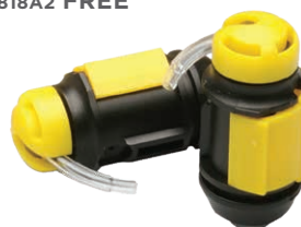
RelyX Unicem Aplicap MMO56815 Assorted (50) MMO56816 Translucent (50) MMO56817 A3 (50) MMO56818 A2 (50)

BUY 3 x RelyX Unicem Aplicap (50) GET 1 x RelyX Unicem Aplicap A2 (50) MMO56818A2 FREE