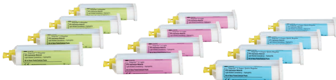
Imprint 4 VPS Impression Material

BUY 3 x Packets of Imprint 4 Cartridges 50ml (4) GET 1 x Packet of Imprint 4 Heavy Body Cartridges 50ml (4) MMO71492 FREE